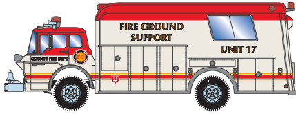
ATH29466 Fire Ground Support #17 ATH29467 Fire Ground Support #20