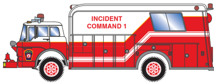
ATH29470 County Fire Incident Command 1 ATH29471 County Fire Incident Command 2