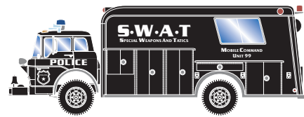
ATH29472 Tri-County Police SWAT Unit 99 ATH29473 Tri-County Police SWAT Unit 100