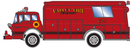
ATH29468 Valley Fire Dept. CMD CP-1 ATH29469 Valley Fire Dept. CMD CP-2