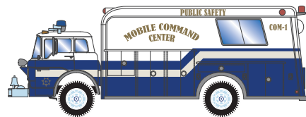
ATH29476 Mobile Command COM-1 ATH29477 Mobile Command COM-2